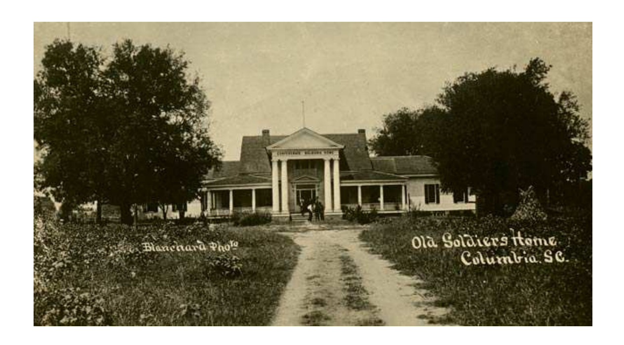
Figure 2.1. The South Carolina Confederate Veterans' Home around the time of the 1920 Sapp Investigation. Taken by Columbia Photographer Blanchard, the institution is referred to as "Old Soldiers Home." Photo Courtesy of the South Carolina Confederate Relic Room and Museum.

the conditions" even as it indicated that "either due to mismanagement or lack of proper interest the Home in the past has not been properly cared for." The solution was to enlist Confederate veterans' best friends. The committee strongly recommended that "at least a minority" of the Home board should be "ladies, for the very good reason that it will only take a glance around the premises to convince one that the helpful influence and beneficial touch of the good women has been lacking in the past, and we believe that if they be given a voice in the administration of the affairs of the Home that a recurrence of the present condition at the Home will be impossible."