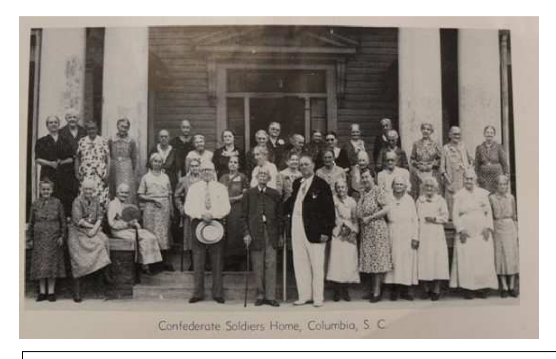
Figure. 4.1. By the early 1940s, very few Veterans were left at the Home. Wives, daughters and nieces clearly outnumber men in this undated photograph.

By January 1944, the last veteran in the institution had passed away. For the next thirteen years, it catered only to women, relatives of Confederate veterans. During this time, the Home more closely resembled a state welfare institution caring for elderly women than a shrine full of living monuments (Fig. 4.1).