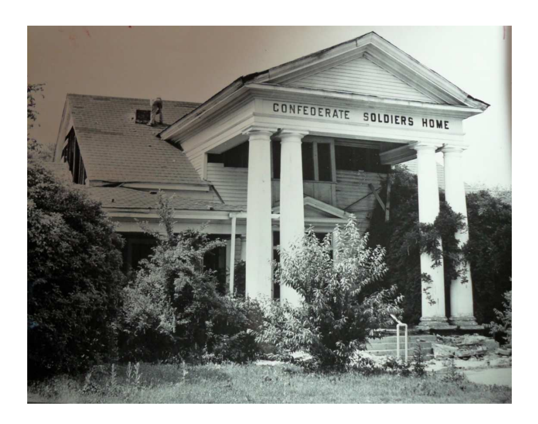
Figure 4.2. In May of 1963, the Confederate Soldiers' Home, overgrown with vines and trees was still standing, being taken down piece by piece. The State on May 23<sup>rd</sup> explained it was being "torn down at a more leisurely pace."

preservation."<sup>92</sup> Another reward for his years of devotional service was his continued use of the state-owned Buick car.